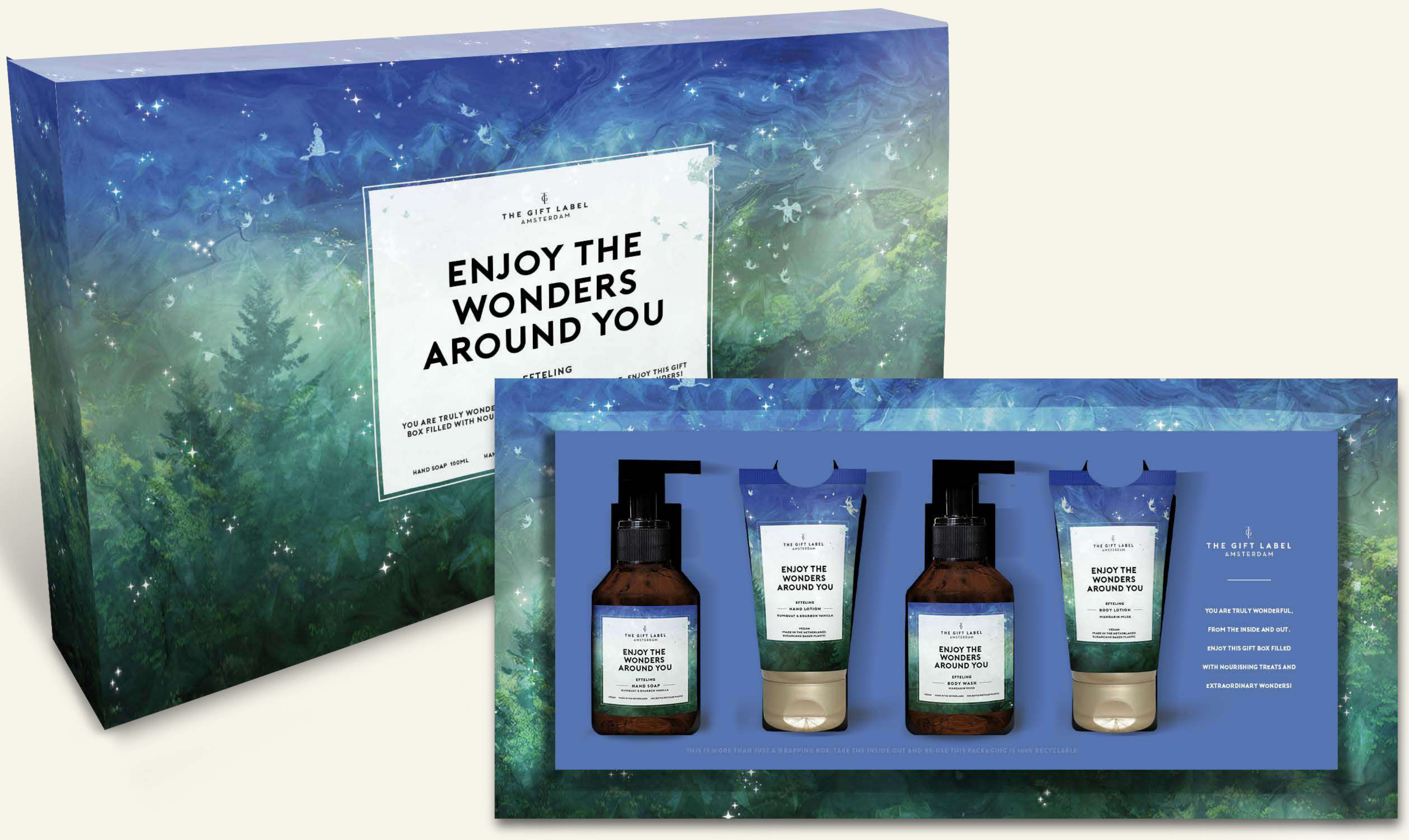
Corporate gifting for Dutch amusement park De Efteling.