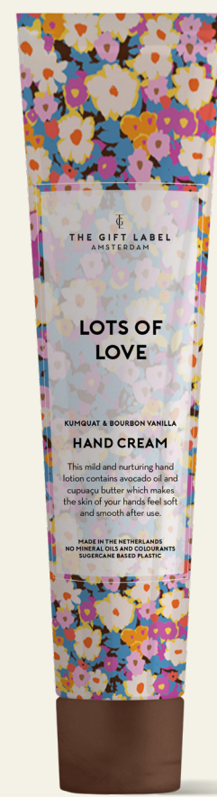
Hand cream tube 1212090 Pre-pack: 8 40 ml