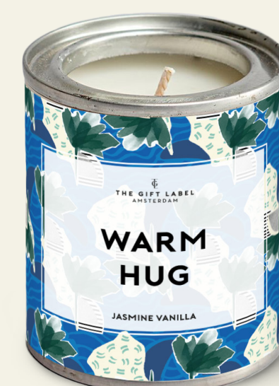
Small candle tin 1011863 Pre-pack: 4 90 gr