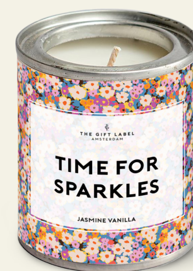
Small candle tin 1011865 Pre-pack: 4 90 gr