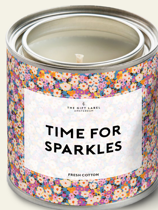
Big candle tin 3100080 Pre-pack: 4 310 gr