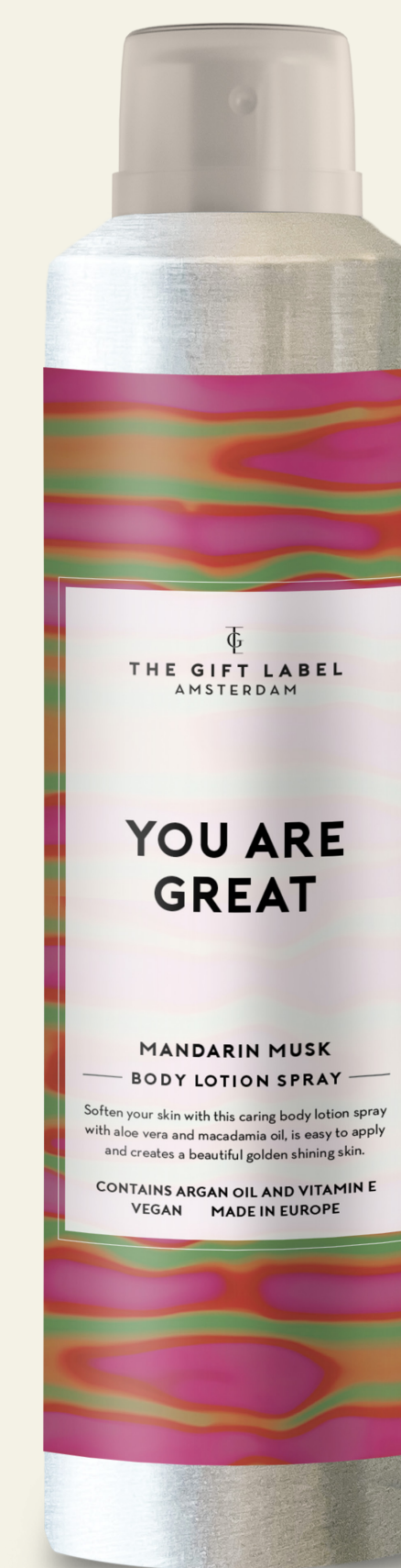
Body lotion spray 1032027 Pre-pack: 6 200 ml