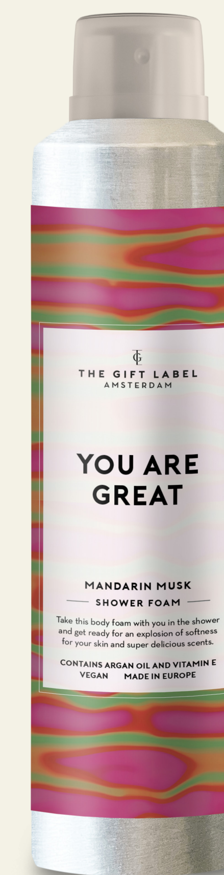
Shower foam 1030048 Pre-pack: 6 200 ml