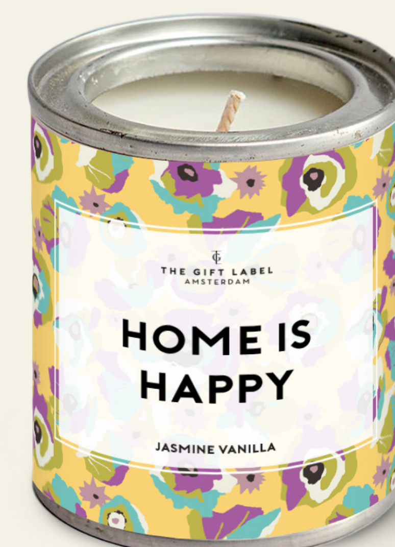
Small candle tin 1011866 Pre-pack: 4 90 gr