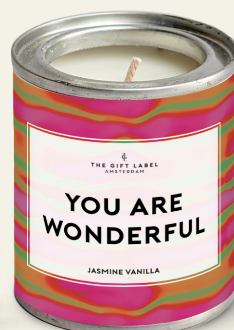
Small candle tin 1011864 Pre-pack: 4 90 gr