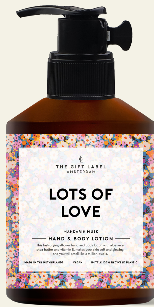
Hand & body lotion 1020122 Pre-pack: 4 200 ml