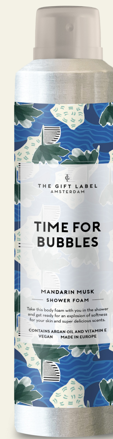
Shower foam 1030047 Pre-pack: 6 200 ml