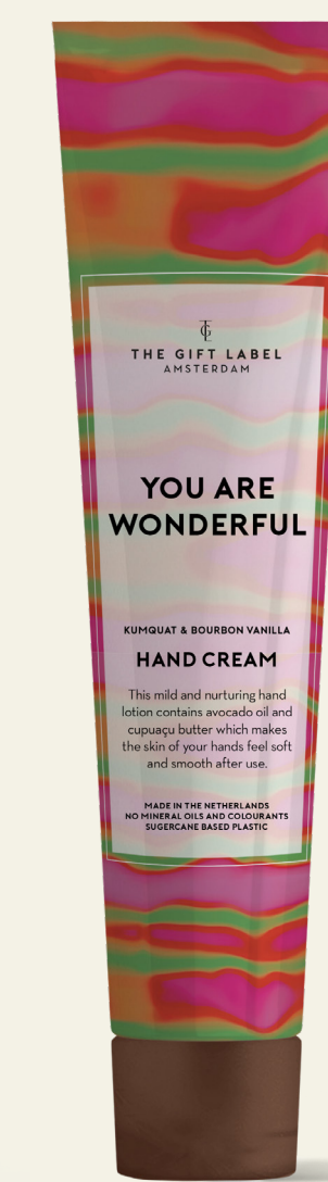
Hand cream tube 1212089 Pre-pack: 8 40 ml