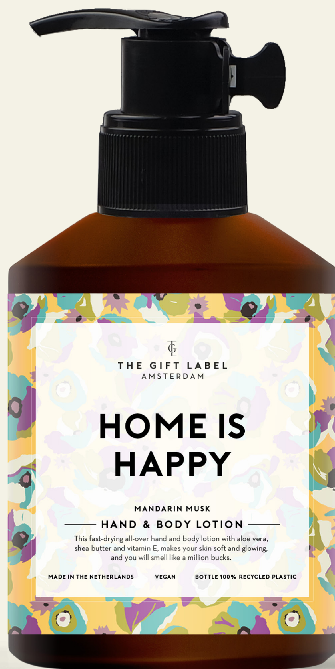
Hand & body lotion 1020123 Pre-pack: 4 200 ml