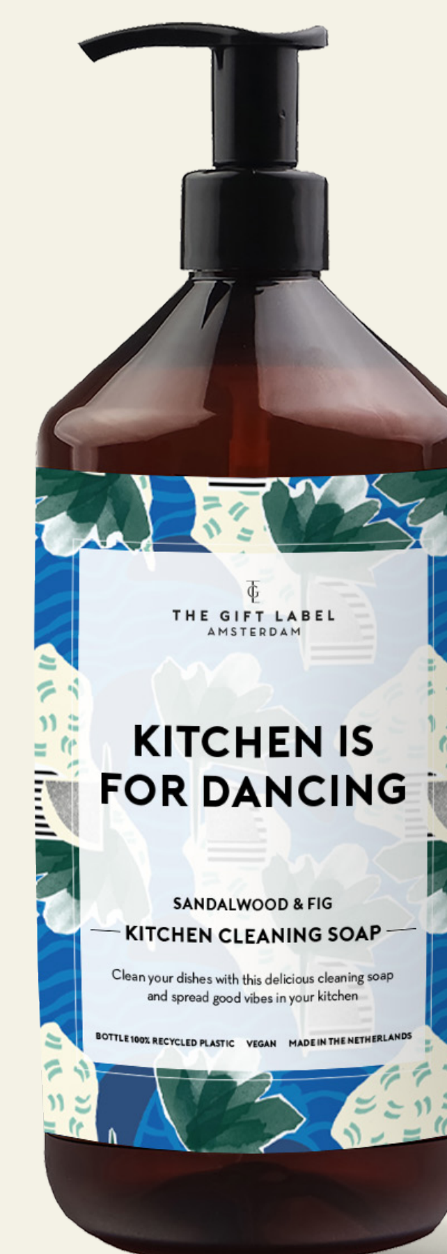
Kitchen cleaning soap 1013349 Pre-pack: 4 1000 ml