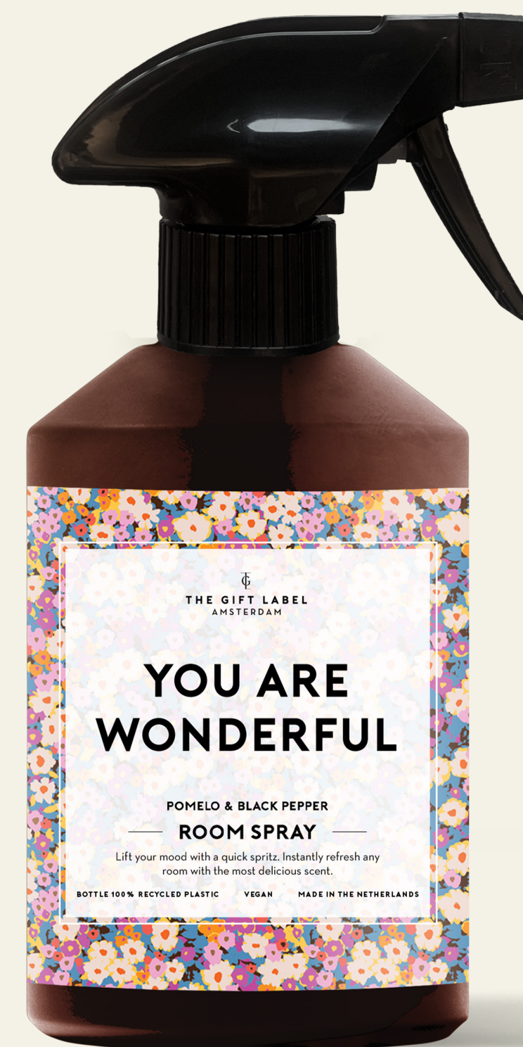
Room spray 1011980 Pre-pack: 6 400 ml