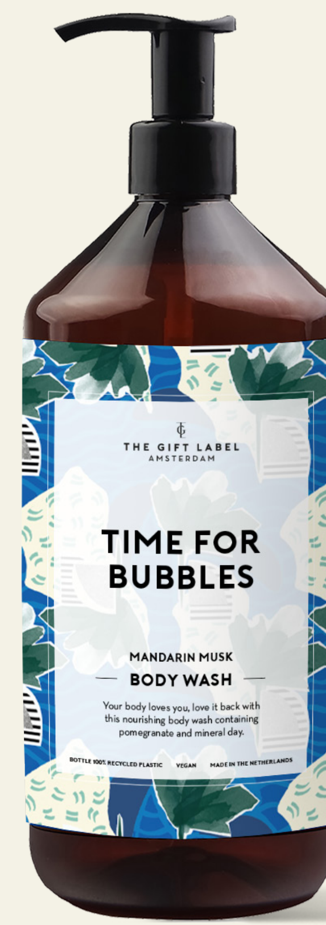
Body wash 1012751 Pre-pack: 4 1000 ml