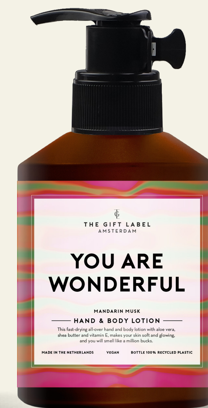
Hand & body lotion 1020121 Pre-pack: 4 200 ml