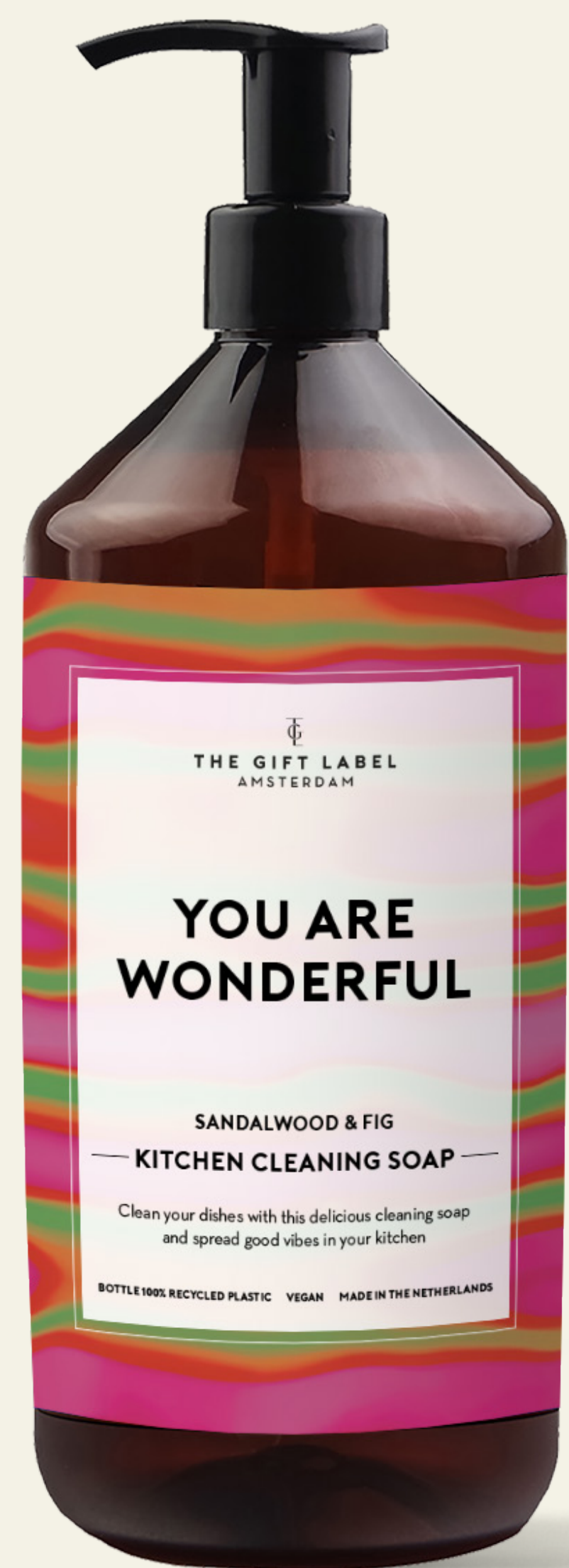
Kitchen cleaning soap 1013350 Pre-pack: 4 1000 ml