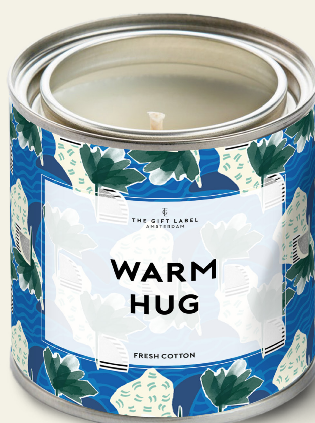
Big candle tin 3100076 Pre-pack: 4 310 gr