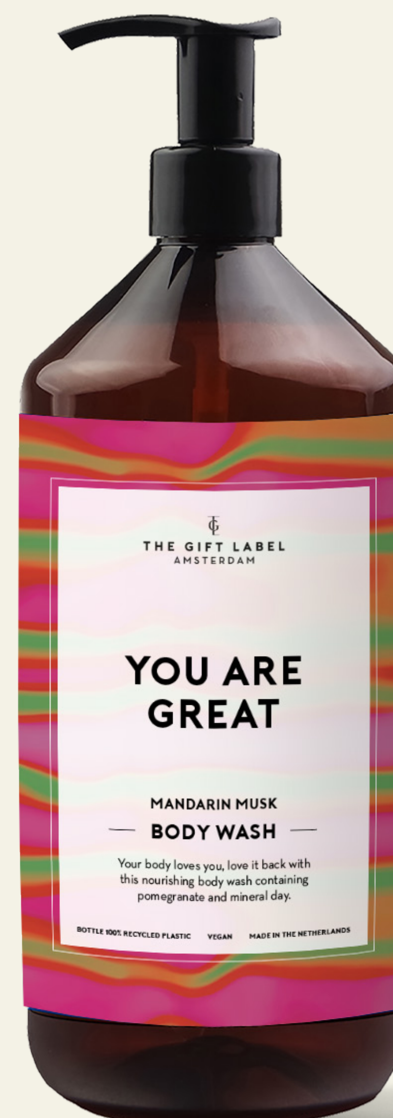
Body wash 1012752 Pre-pack: 4 1000 ml