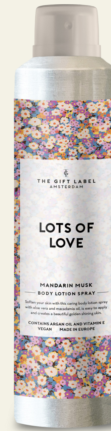
Shower foam 1030049 Pre-pack: 6 200 ml