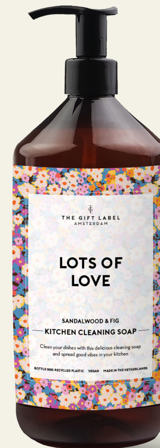
Kitchen cleaning soap 1013351 Pre-pack: 4 1000 ml