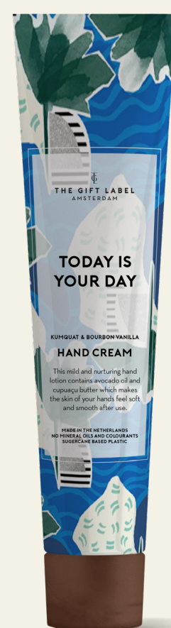
Hand cream tube 1212088 Pre-pack: 8 40 ml