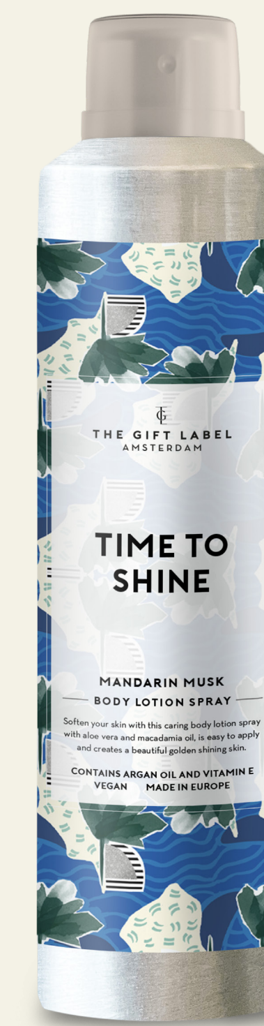
Body lotion spray 1032026 Pre-pack: 6 200 ml