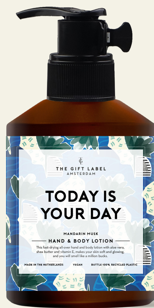
Hand & body lotion 1020120 Pre-pack: 4 200 ml