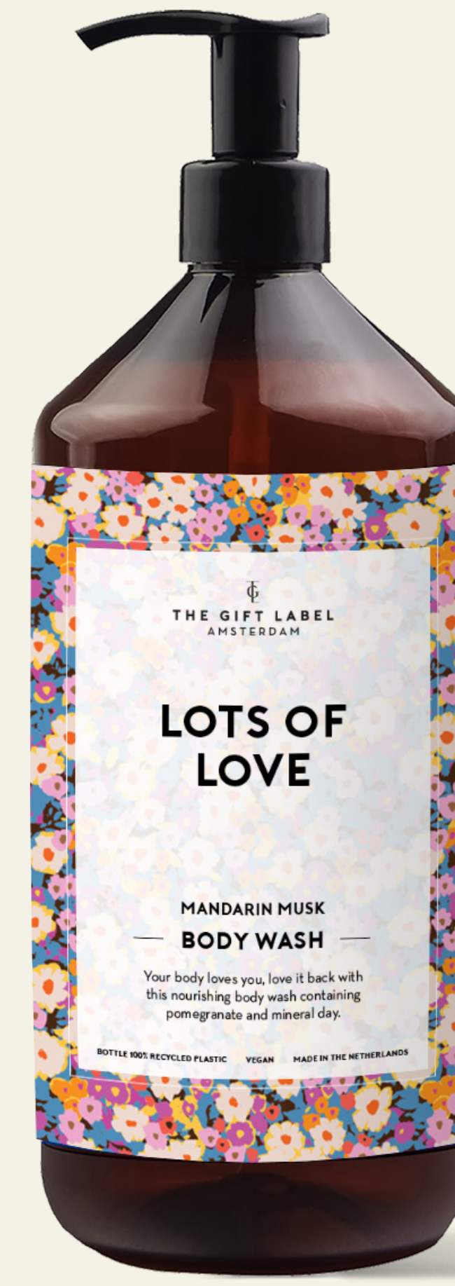
Body wash 1012753 Pre-pack: 4 1000 ml