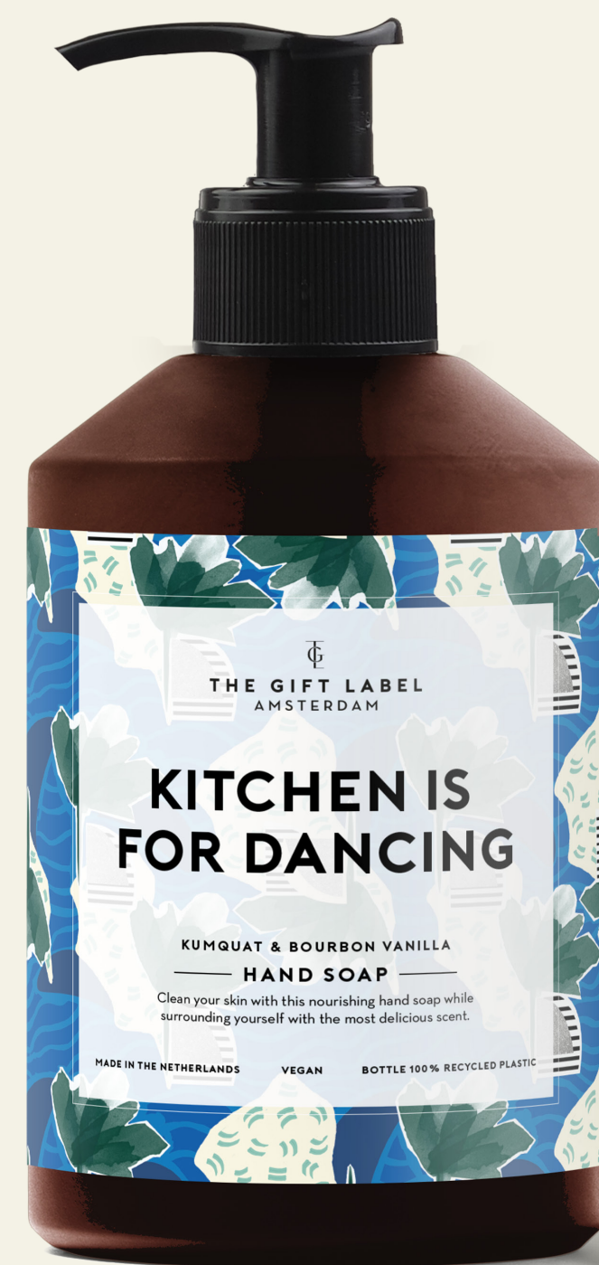
Hand soap 1011561 Pre-pack: 6 400 ml