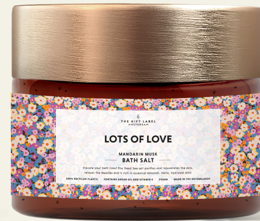
Bath salt 8110111 Pre-pack: 6 300 gr