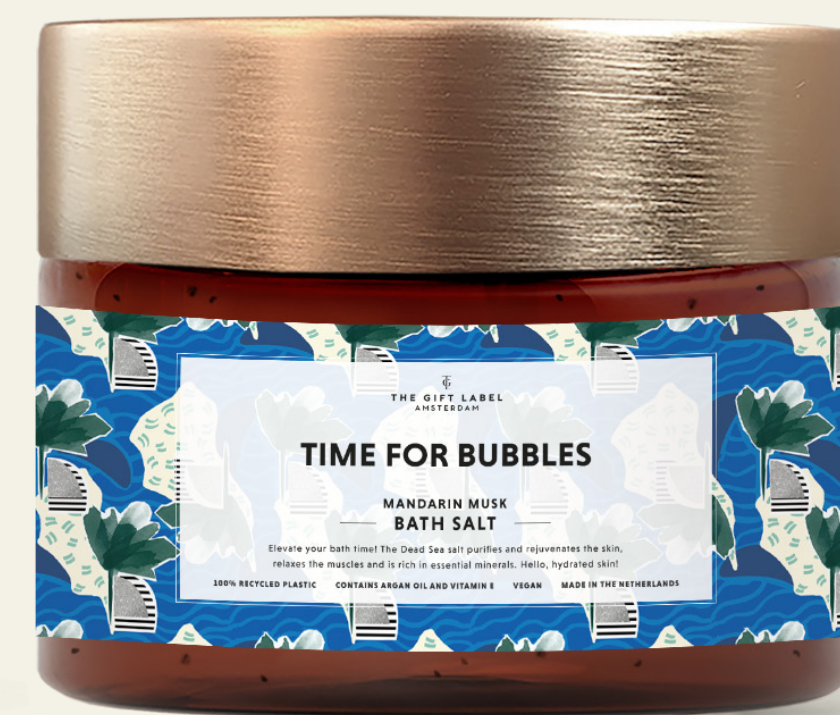
Bath salt 8110110 Pre-pack: 6 300 gr