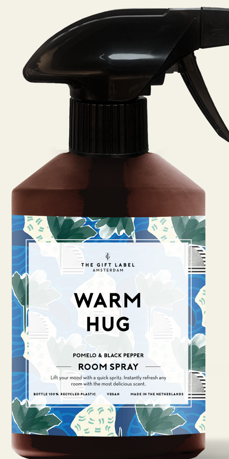
Room spray 1011979 Pre-pack: 6 400 ml