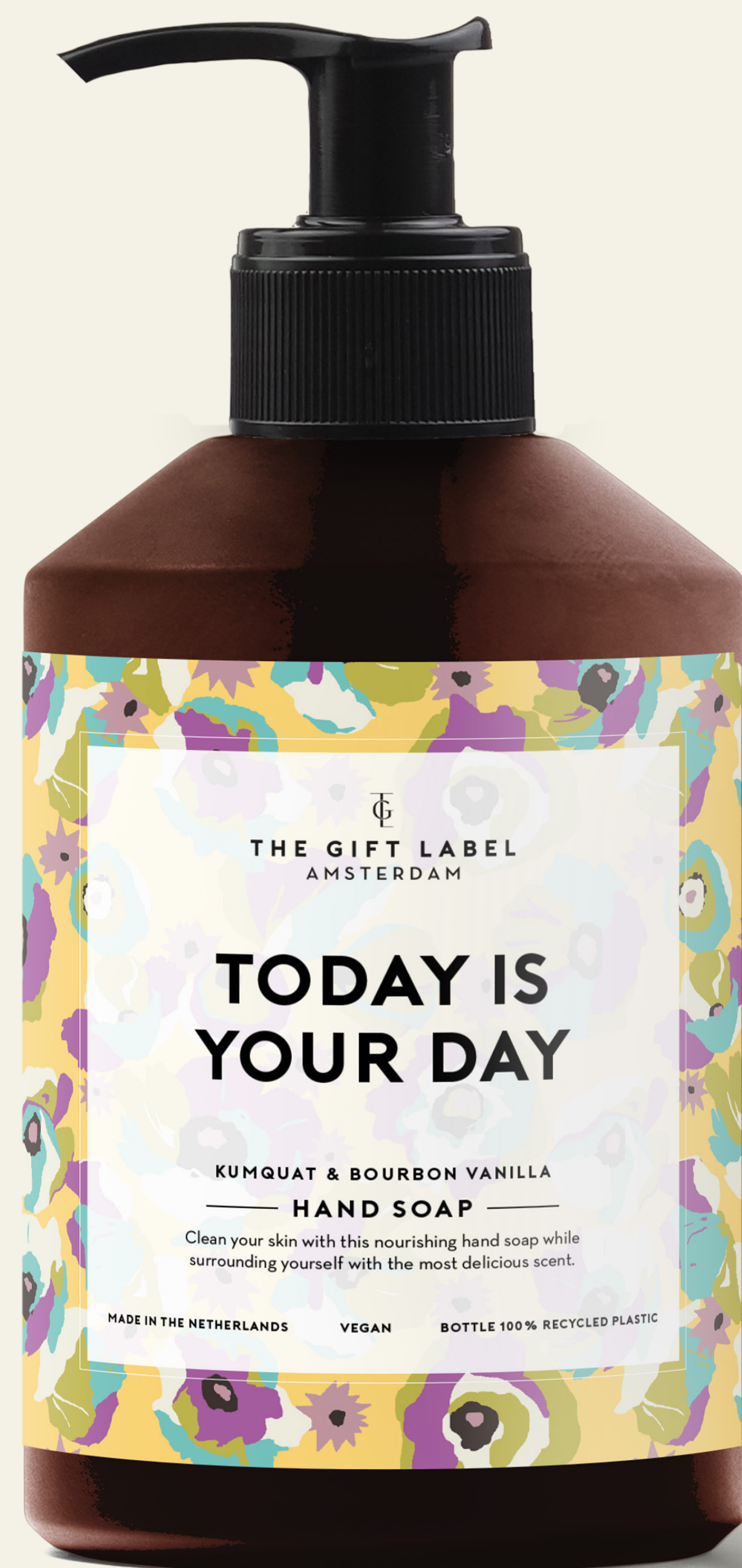
Hand soap 1011564 Pre-pack: 6 400 ml