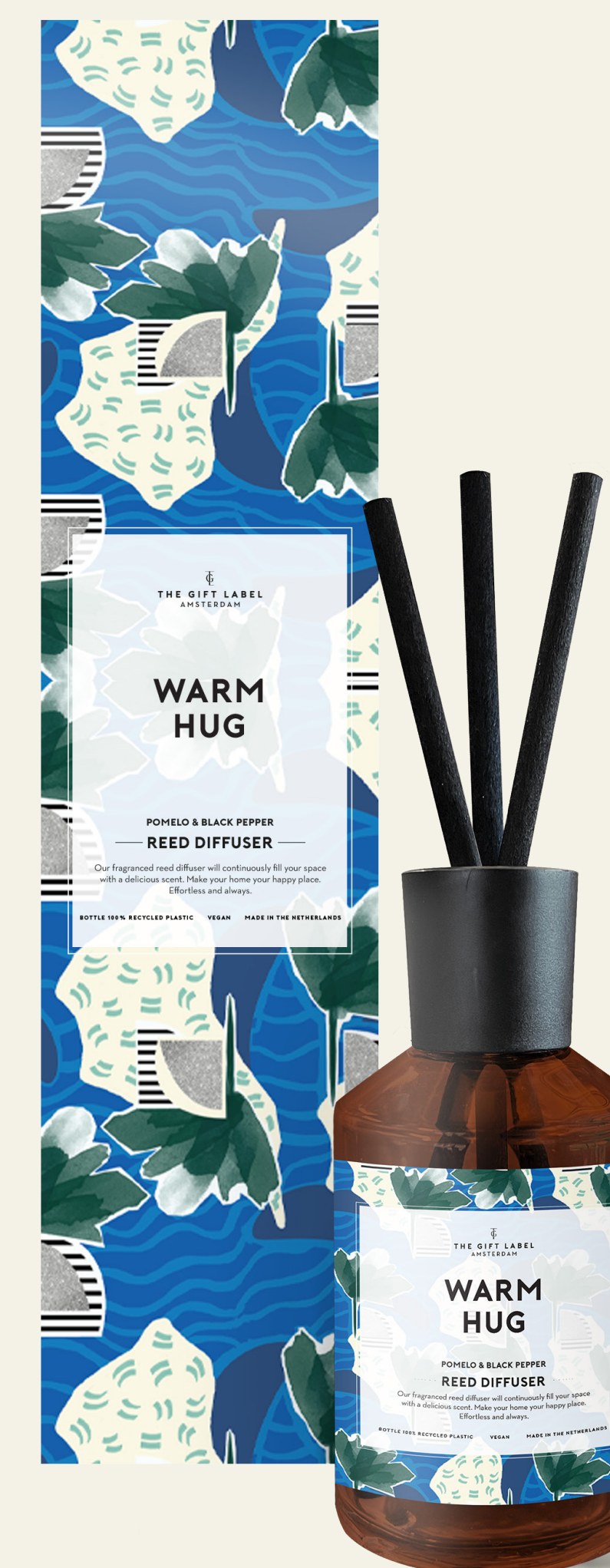
Reed diffuser 10123039 Pre-pack: 4 250 ml