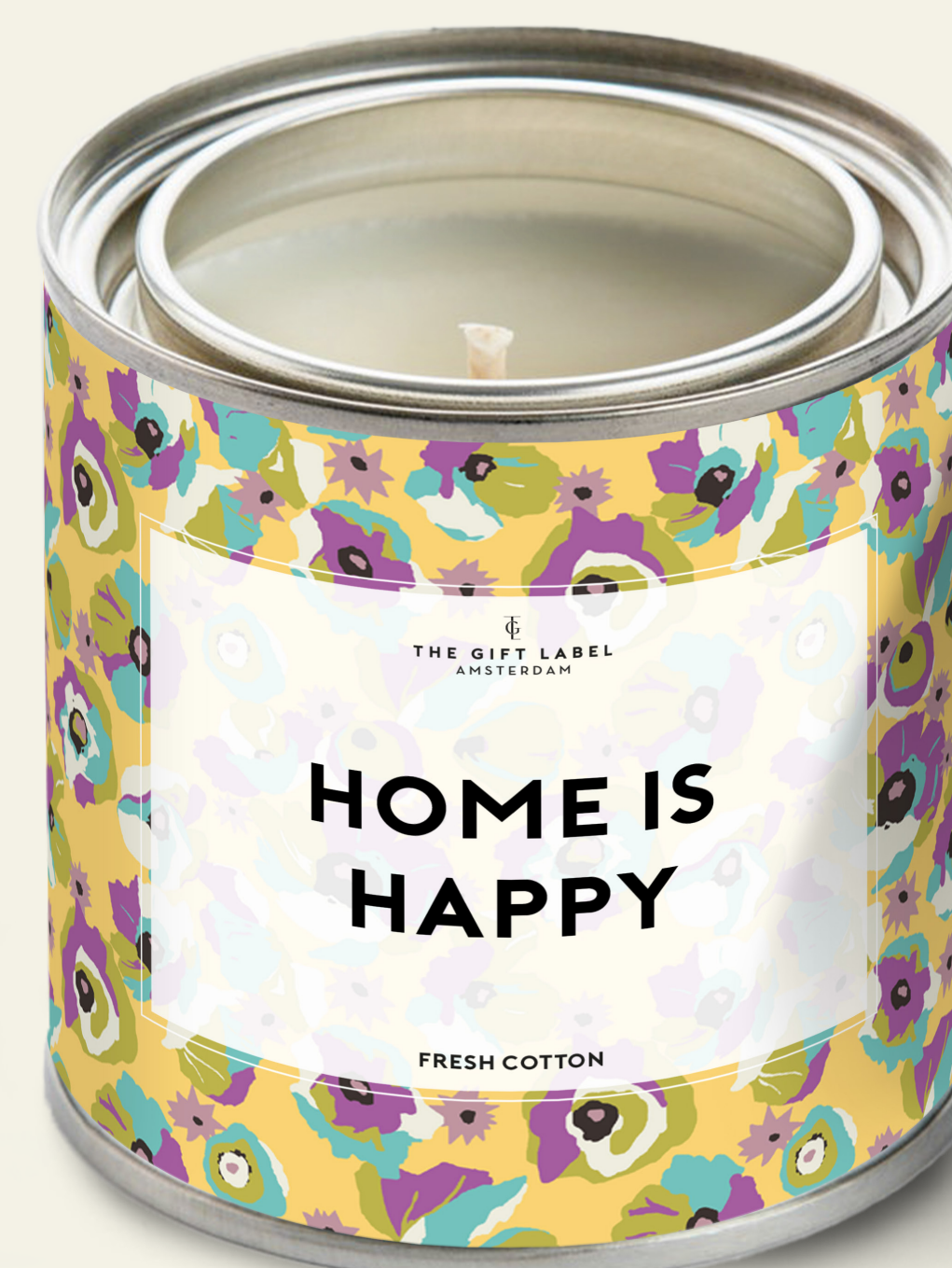
Big candle tin 3100082 Pre-pack: 4 310 gr