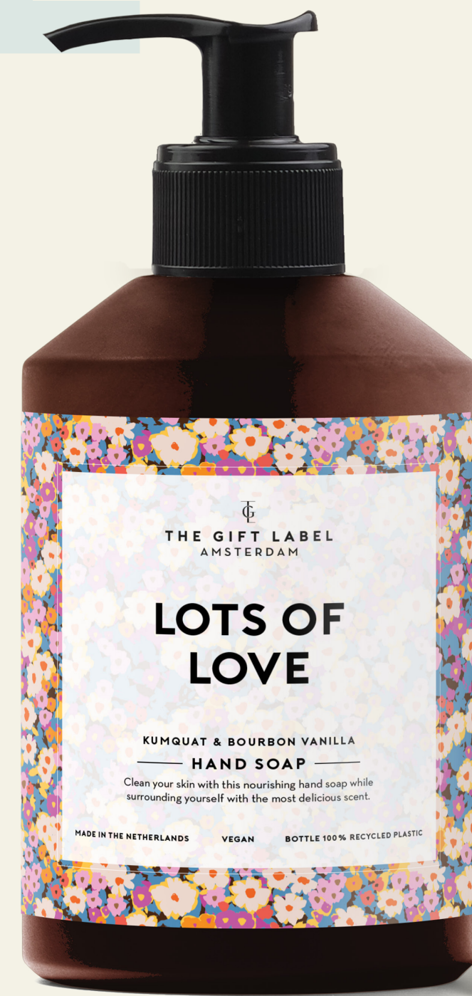
Hand soap 1011563 Pre-pack: 6 400 ml