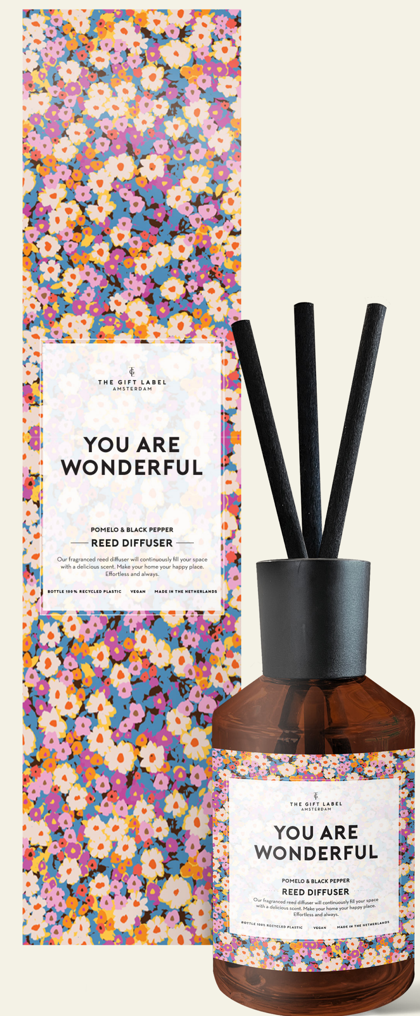
Reed diffuser 10123040 Pre-pack: 4 250 ml