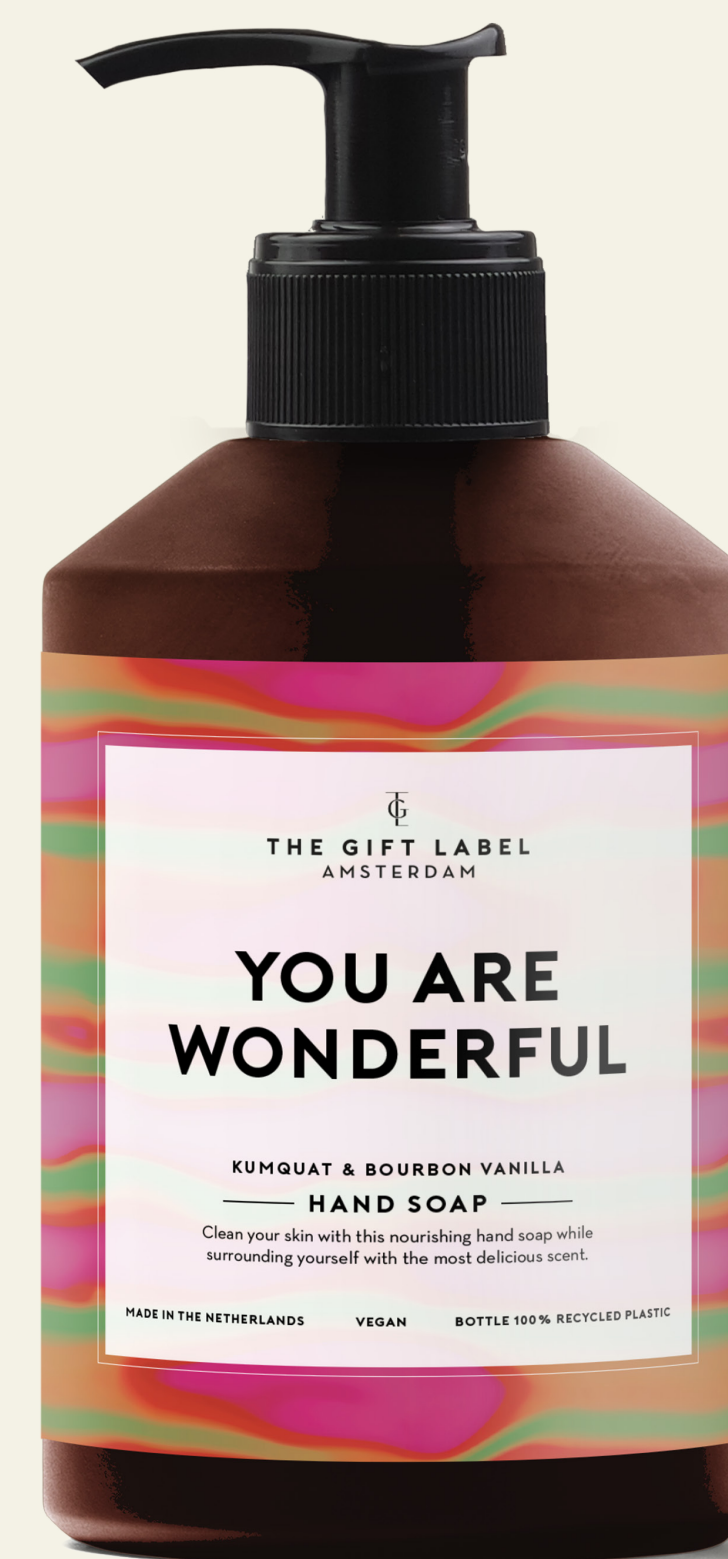
Hand soap 1011562 Pre-pack: 6 400 ml