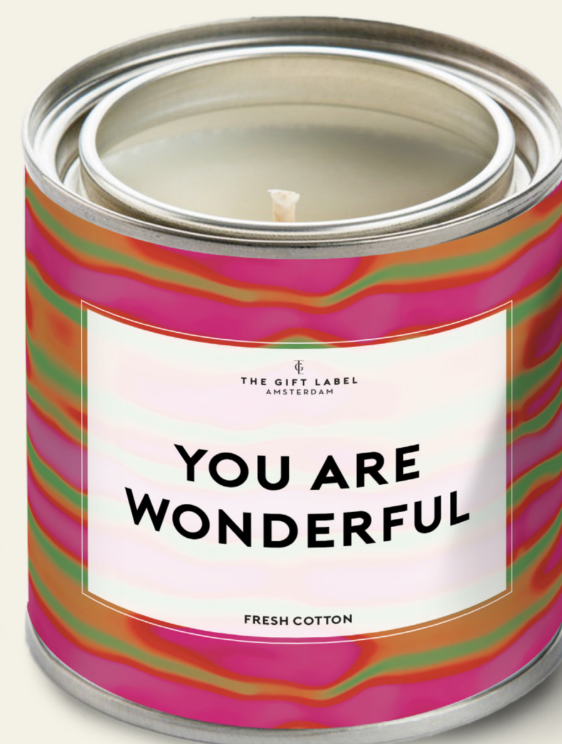
Big candle tin 3100078 Pre-pack: 4 310 gr