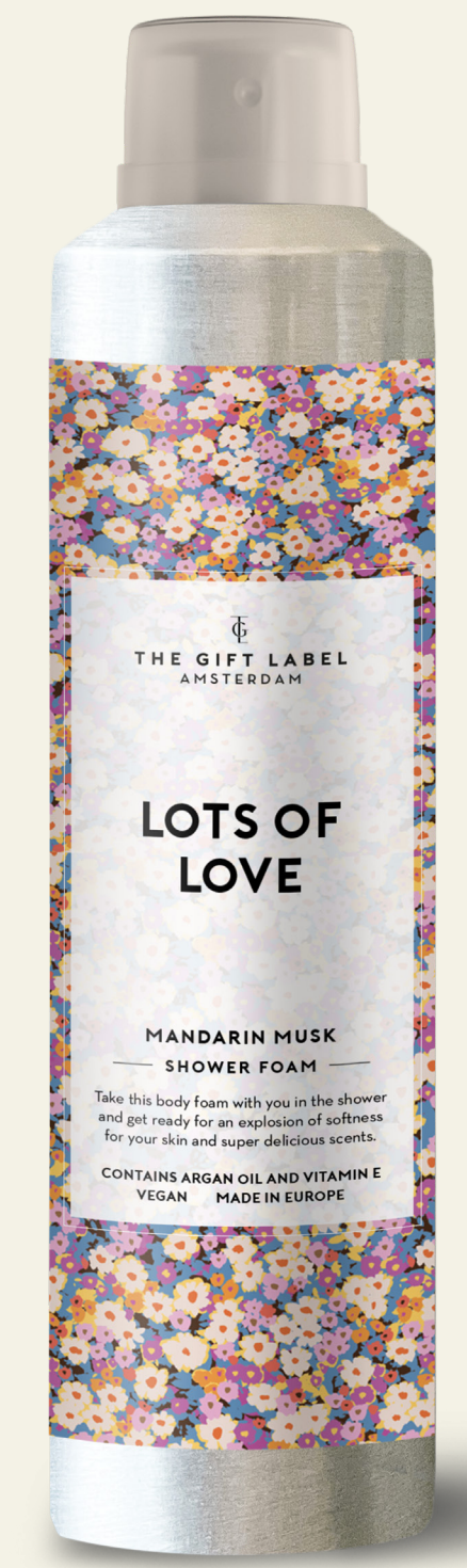
Body lotion spray 1032028 Pre-pack: 6 200 ml