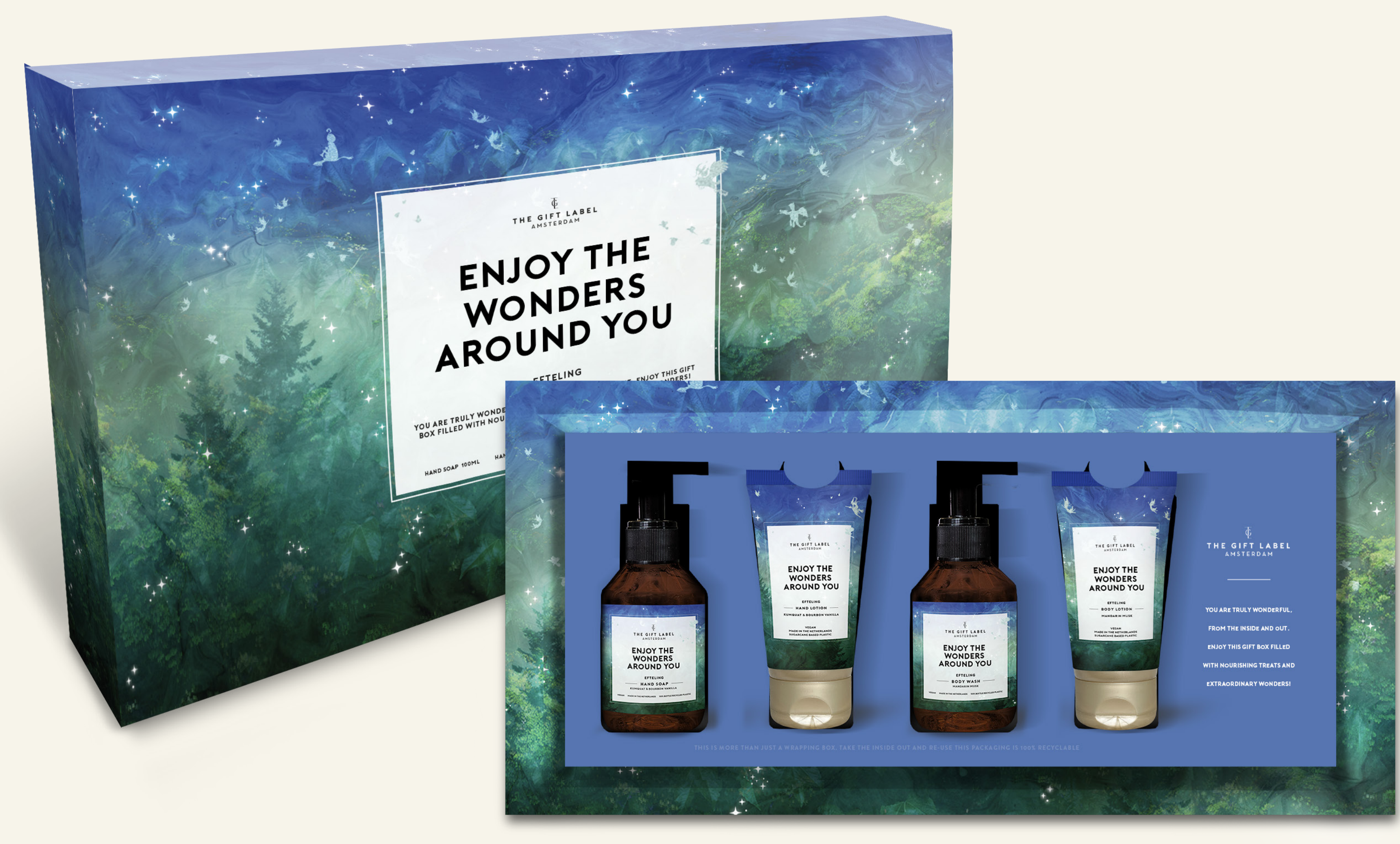
Corporate gifting for Dutch amusement park De Efteling.