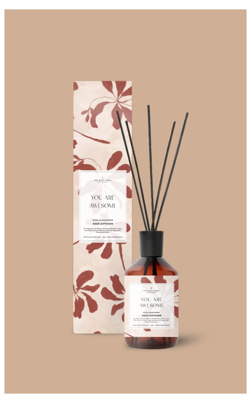
You are awesome